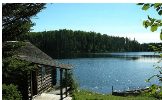
Grey Owl's Cabin

The question I have to ask myself is this: is researching and writing a story on climate change worth its weight in carbon? Or are writers who travel extensively really just documenting the failure of our